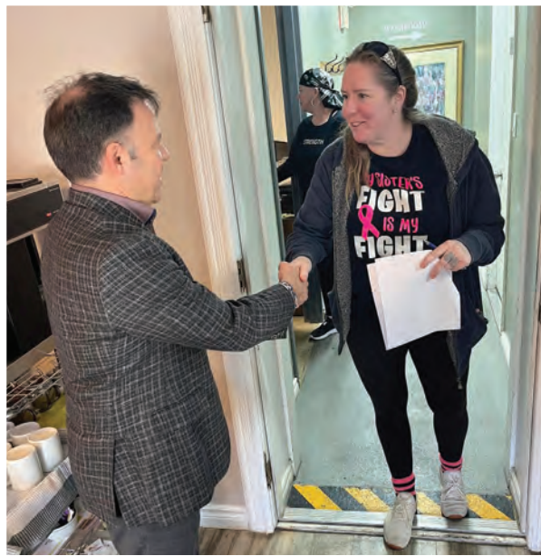
With a constituent in Harrow