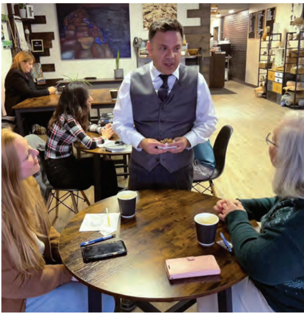
Hosting a coffee house in Belle River