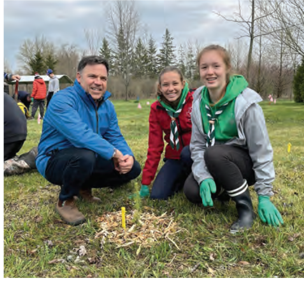
At Bryerswood Youth Camp on Earth Day