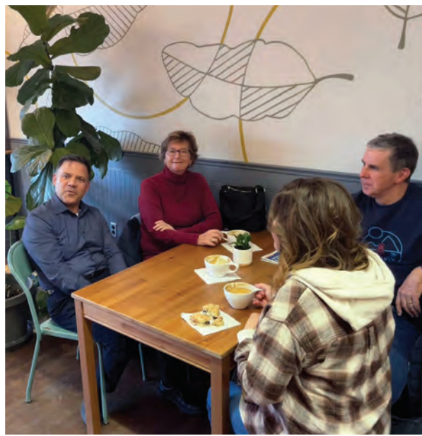
With constituents in Kingsville