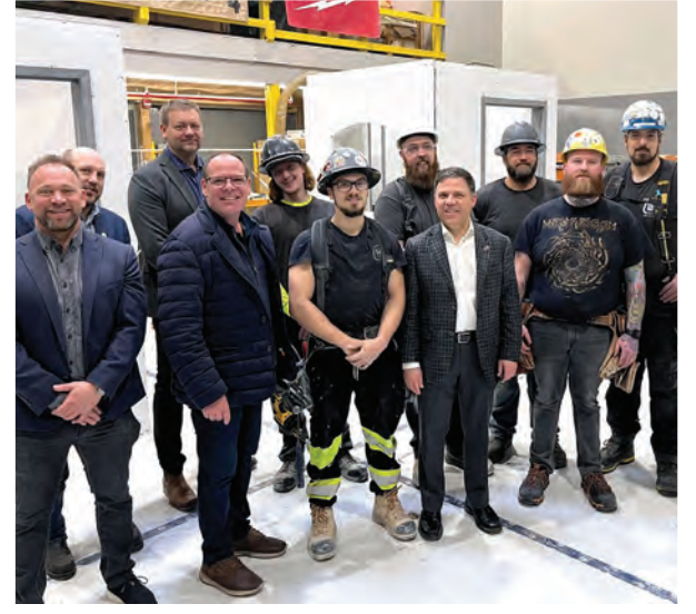
At the Carpenters Local 494 Apprenticeship Competition