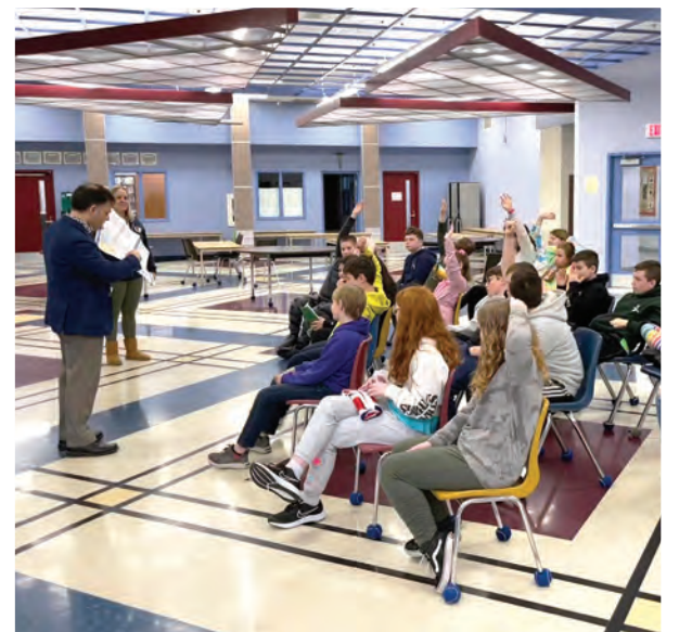
With students of Holy Name Catholic Elementary School in Essex