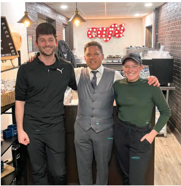
With constituents in Belle River