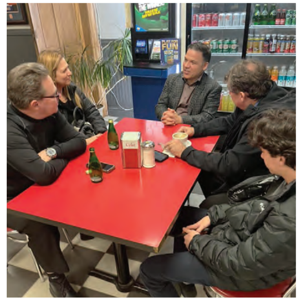
With constituents in Amherstburg